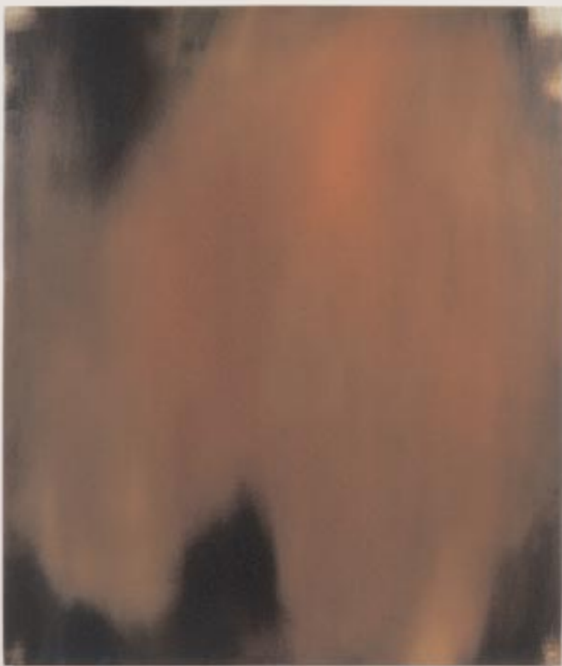
Format: 130x110 cm