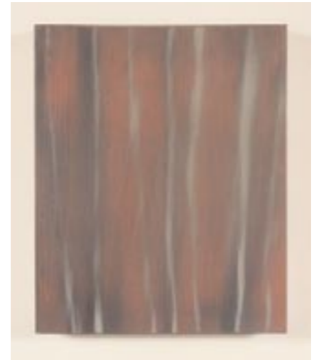
Format: 15,5x12,5 cm