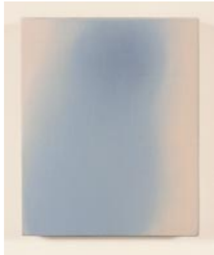
Format: 15,5x12,5 cm