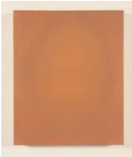
Format: 15,5x12,5 cm